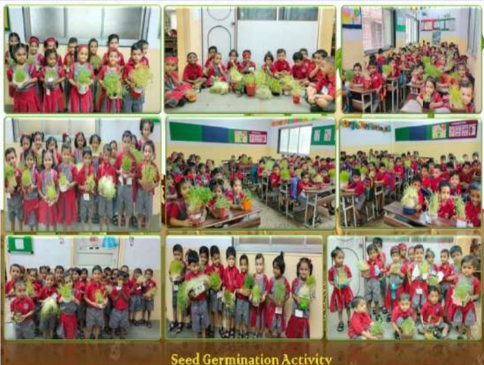
Seed Germination Activity