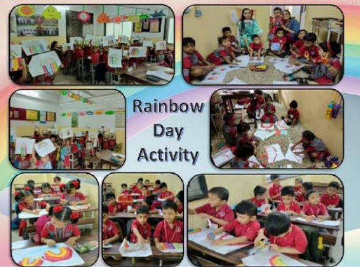
Rainbow Day Activity