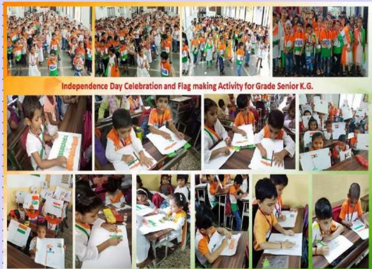
Independence Day Celebration and Flag making Activity for Grade Senior K.G.