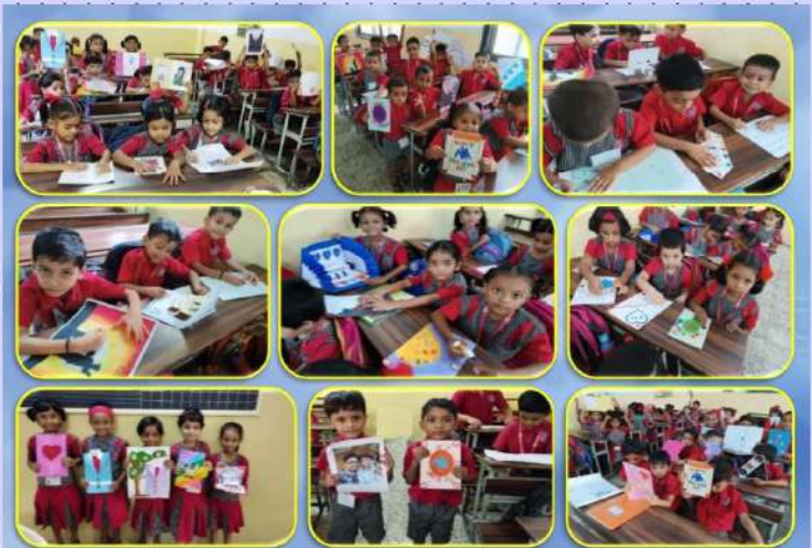
Father Day Activity