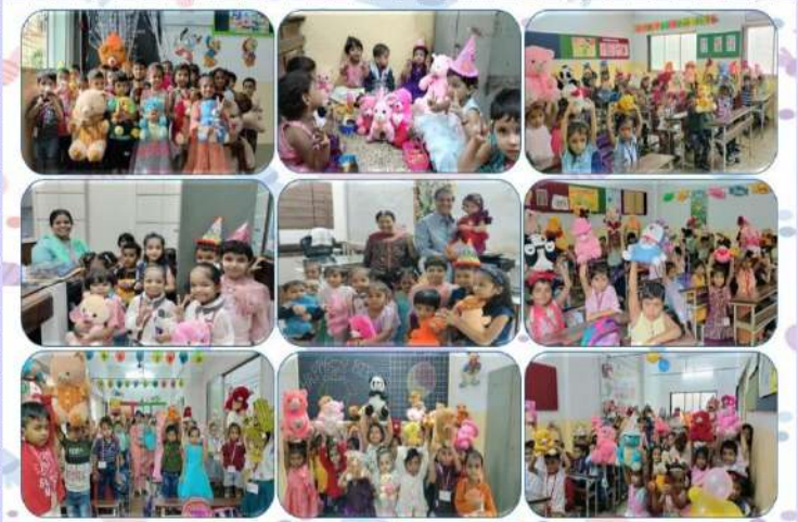
Teddy Bear Birthday Celebration